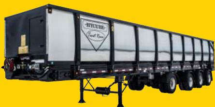
Ideal for increased volume