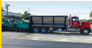
Safer Than A Dump