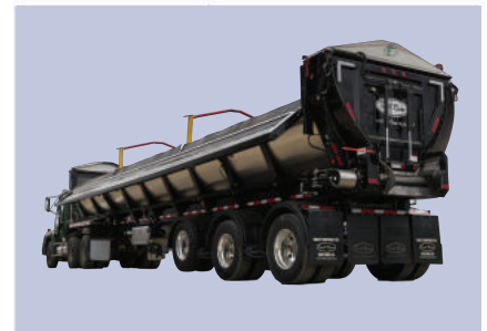
Hydraulic Side Doors