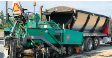
Unload Partial Loads