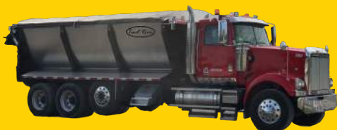
Great in tight spaces