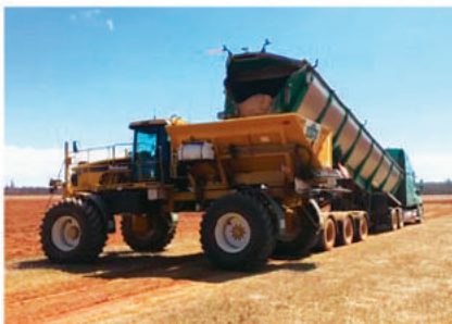
Rear Lift Live Bottom