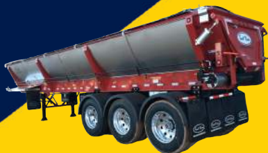
The Ultimate Road Builder