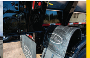
Pneumatic Mud Flaps