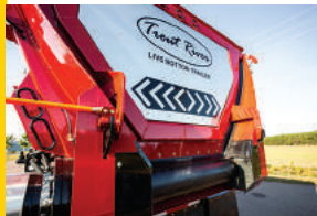
Hardened Seal Plates